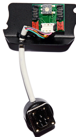
TTL-Converter for Olympus for SEACAM underwater housings