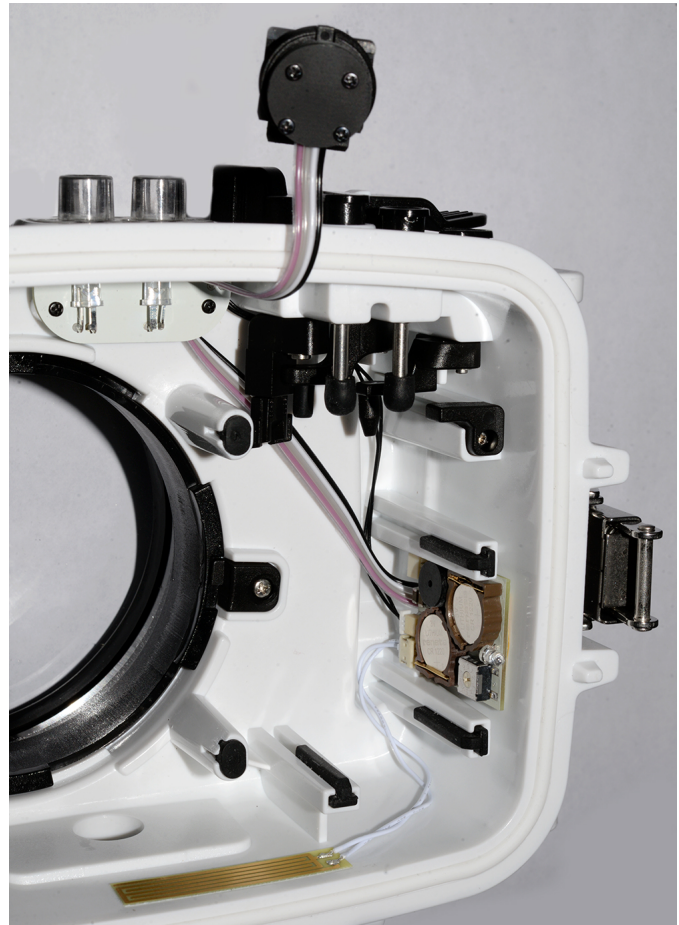
Optoelectronic TTL-Converter for SEAFROGS (MEIKON) housings for Sony A6xxx